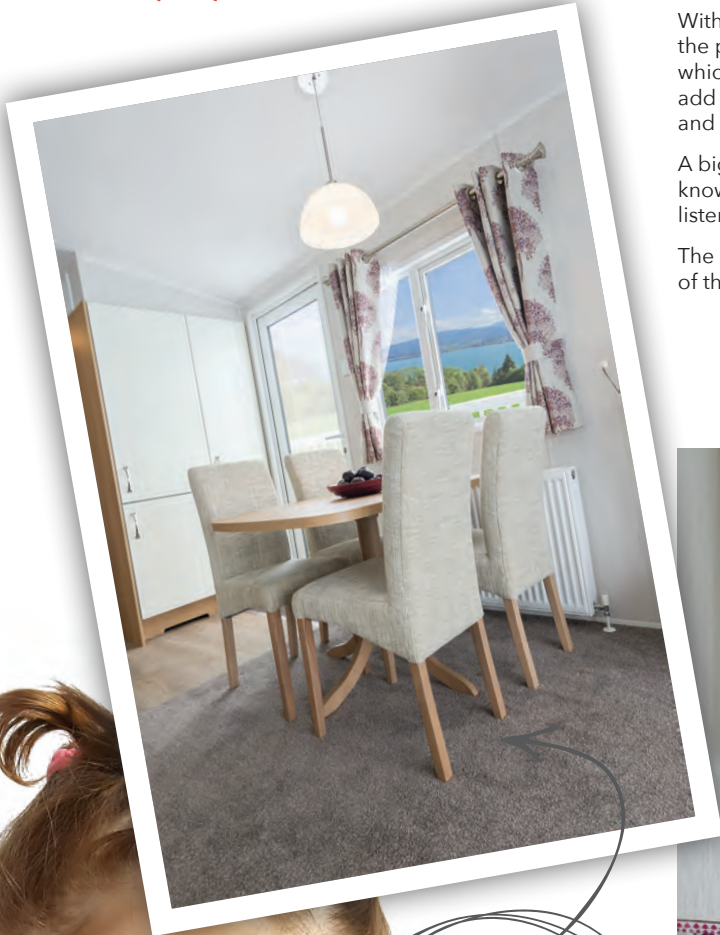
Window beside the dining table lets the light cascade through

The Sierra is stylish, practical and affordable making it one of the most popular models in the Willerby range.