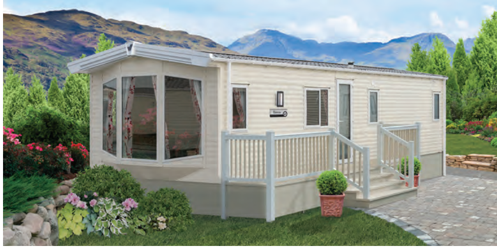
Illustrated with optional Outlook French doors