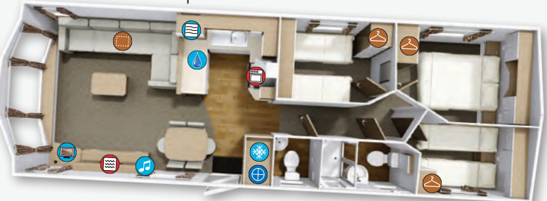
37 x 12 2 bedroom sleeps 6