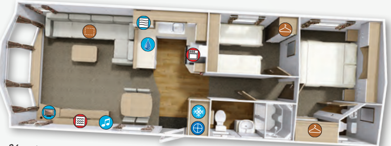
36 x 12 3 bedroom sleeps 8